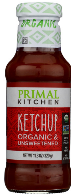
Primal Kitchen Organic Ketchup

Add bold, crave-worthy flavor to the real foods you love with Primal Kitchen Organic Unsweetened Ketchup and Mayo with Avocado Oil. Our premium pantry staples are made with real ingredients like organic California-grown tomatoes and cage-free eggs for a classic taste that kids and parents love. No artificial sweeteners and no nonsense!