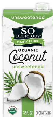
So Delicious Organic Coconut Milk selected varieties