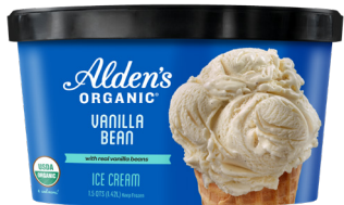
Alden's Organic Organic Ice Cream selected varieties