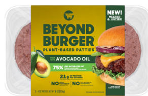
Beyond Beyond Burger