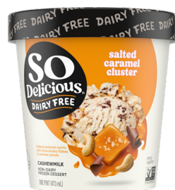
So Delicious Plant-Based Frozen Dessert selected varieties