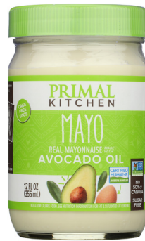
Primal Kitchen Mayo