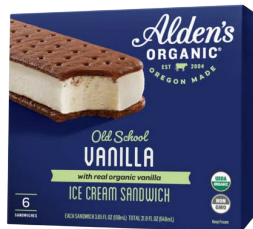
Alden's Organic Organic Ice Cream Sandwiches

Made with organic ingredients and a focus on responsible sourcing, Alden's Organic is a Certified B Corp committed to supporting communities—bringing rich, creamy ice cream to your table while doing things the right way.