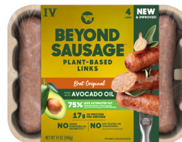
Beyond Beyond Sausage selected varieties